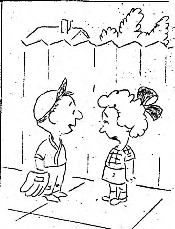
"I'd see more of you, Only I'll be busy traveling with the team this summer." Romano